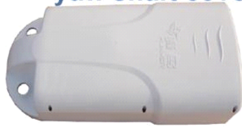
yaw shaft cover